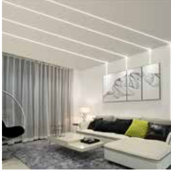
Tavan Aydınlatma Ceiling Lighting