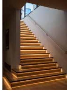
Çizgisel Aydınlatma Linear Lighting