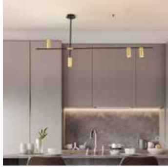
Mutfak Aydınlatma Kitchen Lighting