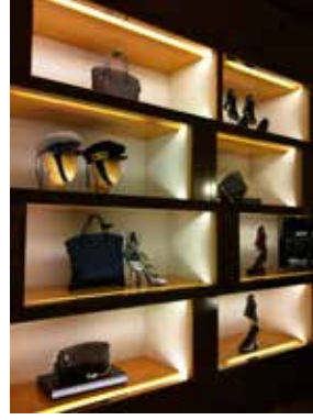
Raf Aydınlatma Shelf Lighting