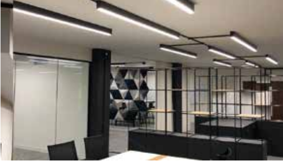
Dekoratif Aydınlatma Decorative Lighting