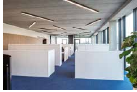
İç Mekan Aydınlatma Indoor Lighting