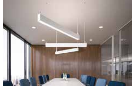
Dekoratif Aydınlatma Decorative Lighting