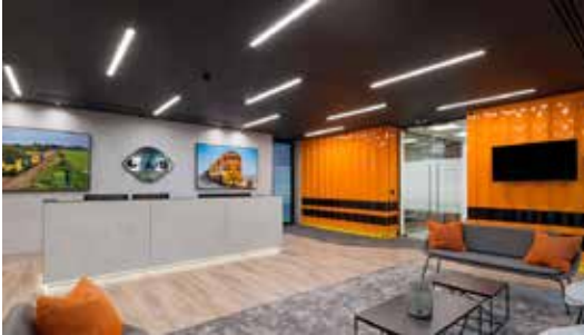
İç Mekan Aydınlatma Indoor Lighting